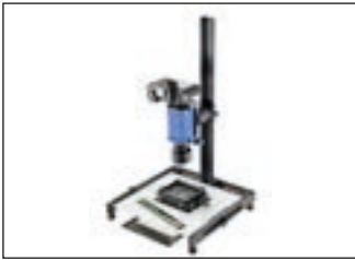
10_REPRO-Plexiplatte+Film.jpg Macro-Repro Copystand in use w/ slide- and negative duplicator MS-FILMCOP on translucent base plate, bellows BAL-F + spacer