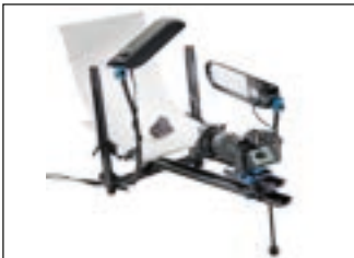
13_REPRO-Plexiplatte+Hohlkehle.jpg Macro-Repro Copystand in use as subject holder (horizontal) with MS-REPRO-LIGHT and Infinity Cove MS 30