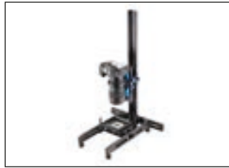
11_REPRO-DIA.jpg Macro-Repro Copystand in use w/ slide- and negative duplicator MS-FILMCOP (inserted into guide rails) and Focusing Rail CASTEL-QP