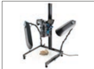
14_REPRO-Plexiplatte+Scherbe Macro-Repro Copystand in use as subject holder (vertical) with MS-REPRO-LIGHT and Focusing Rail CASTEL-QP