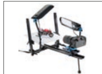
15_REPRO-Produkt-Motorrad Macro-Repro Copystand in use as subject holder (horizontal) with MS-REPRO-LIGHT and Focusing Rail CASTEL-QP