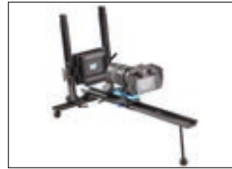
12_REPRO-Film.jpg Macro-Repro Copystand in use w/ slide- and negative duplicator MS-FILMCOP (inserted into guide rails) and QPL-Coupling plate